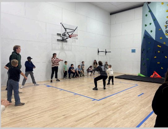
Kids learn proper squatting form