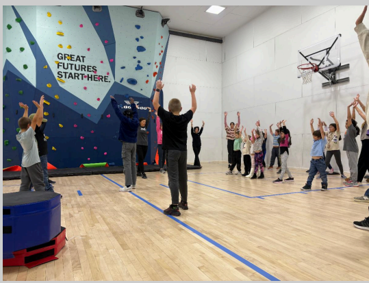
Kids practice the entry move for handstands