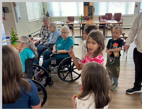
Caroling at Columbine Manor