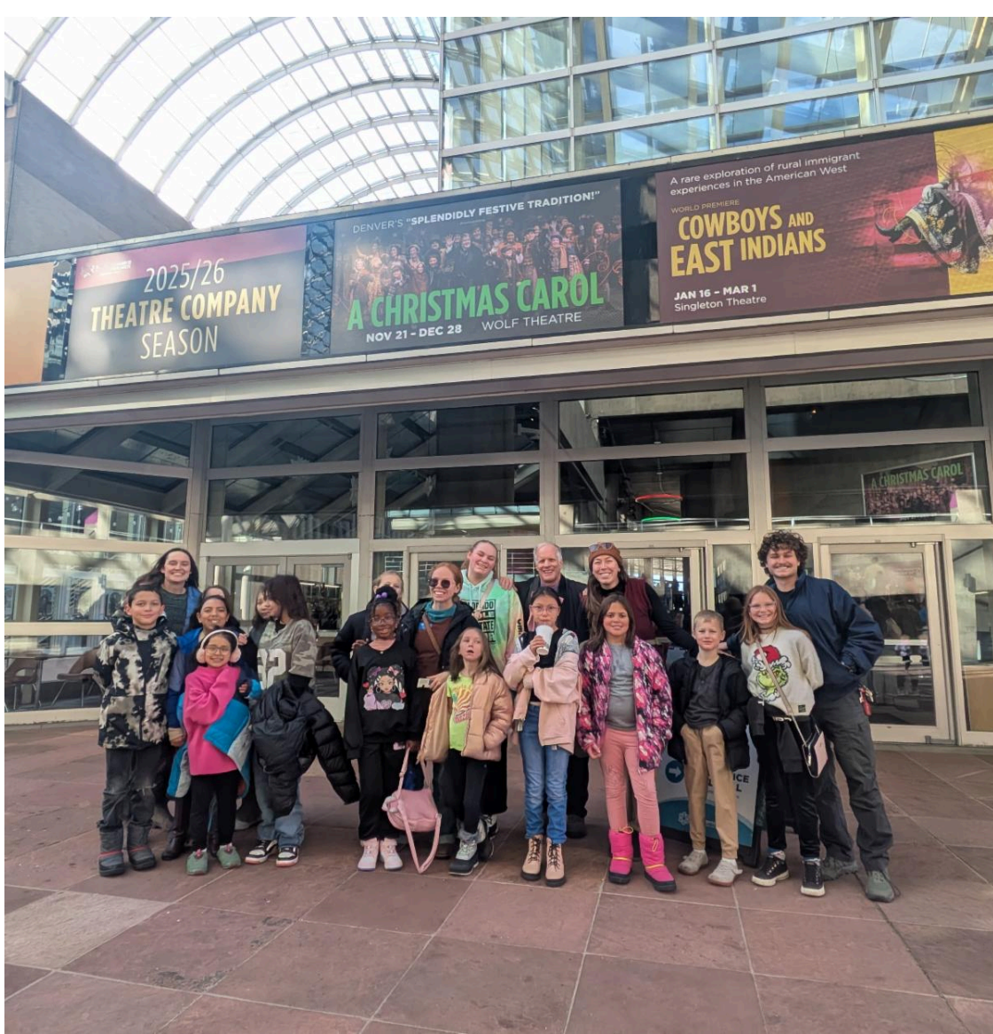
Club kids and staff at the Denver Center for the Performing Arts